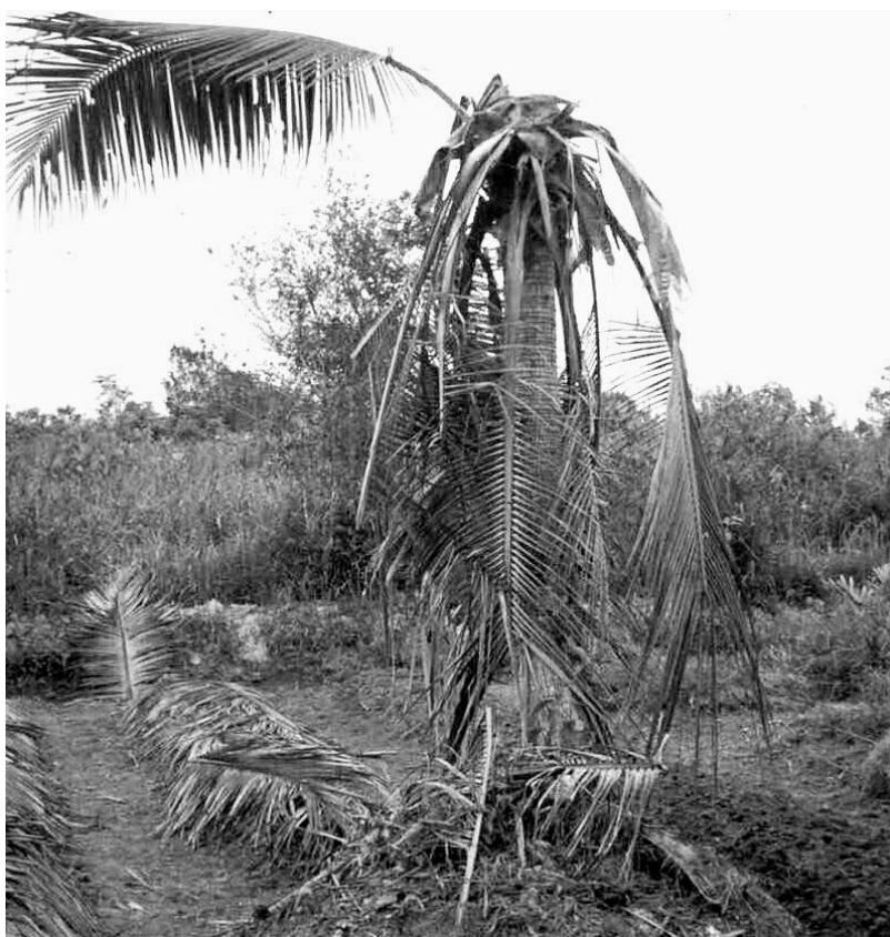
Fig. 2. Coconut palm tree damaged (and probably killed) by a sun bear in a garden adjacent to the Sungai Wain Protection Forest, East Kalimantan, Indonesia 1998.

financial compensation was justified. Moreover, no active wildlife authority existed in the district to whom farmers could forward complaints or damage claims. In a few cases, where entire coconut stands had been killed by bears or when a large portion of a small stand of snakefruit had been consumed by a bear, farmers asked our survey team for compensation or removal of the bear.